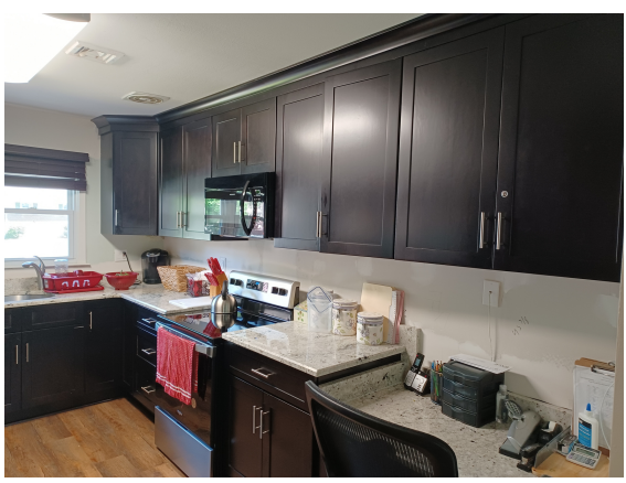
Beautiful, updated kitchen.