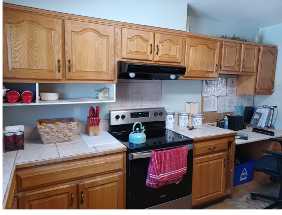
West Normandy kitchen before.

Our group home located on West Normandy Drive recently underwent a number of renovations which included a new kitchen, new basement floors, fresh paint, and a new front walkway. Thanks to our DDS funding and their support we were able to make all of these updates.