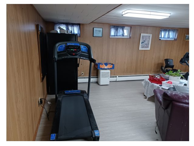
West Normandy basement with old floors (left) and bright, new floors (right).